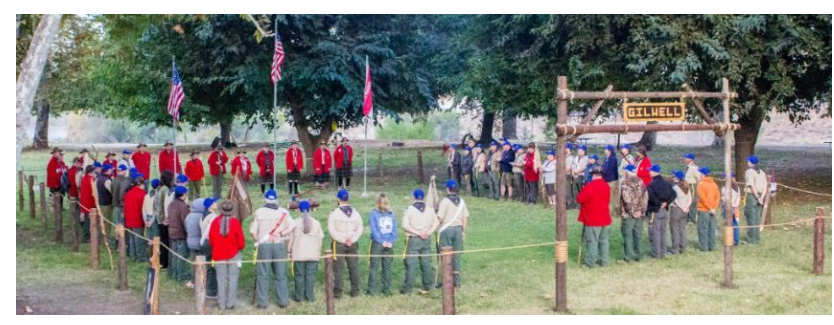
Camp Warren McConnell 11760 LIVINGSTON CRESSEY RD Livingston, CA 95334

The W3-59-22 WOOD BADGE COURSE is limited to 48 Participants. REGISTER TODAY. The complete course fee is $275 before August 12, 2022. A deposit of $50 is required to hold your spot and full payment is due by 08/12/2022. The increased course fee of $300 will apply after 8/12. Please go to www.yosemitescouting.org to register. Options are available online or by calling the GYC Council Office at 209-545-6320.