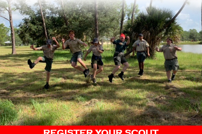
REGISTER YOUR SCOUT OR VENTURER TODAY AT:

WEEKEND #1: JANUARY 20TH - 22ND, 2023 WEEKEND #2: FEBRUARY 17TH - 19TH, 2023